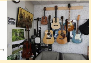
•Acoustic guitar•Shamisen •Electric guitar •Ukulele•Guitar amplifier

•Powered mixer JBL EON208P •Microphone Audio Technica •PA speaker JBL JRX212 •Speaker, microphone stand •2.1ch compact audio amplifier output 45W+45W+68W